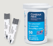
GMS code is 15963